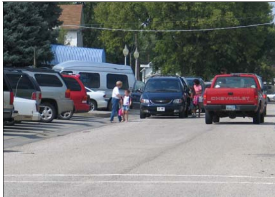
School traffic makes this Minneapolis street congested, similar to many communities.

The intent of the SRTS program is to enable and encourage children to walk or bicycle to school; make walking or biking to school