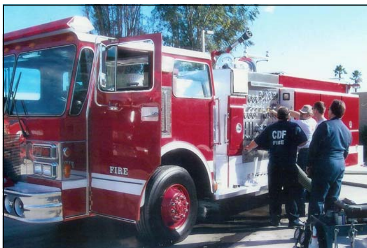
The Riverside County Fire Department spent an afternoon training the Mitchell County RFD No. 3 representatives on the new truck.

“I think they would make good wild land engines and could be a good deal if de-