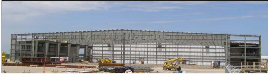
Construction is under way on a new hangar/office complex at the SLN Aviation Service Center. The hangar is targeted for completion in Fall 2008.

The Salina Municipal Airport currently offers two flights daily to Kansas City and two flights daily to Denver. Demand for these flights is increasing. In May, passenger levels reached 350 as compared to just 185 during May 2007.