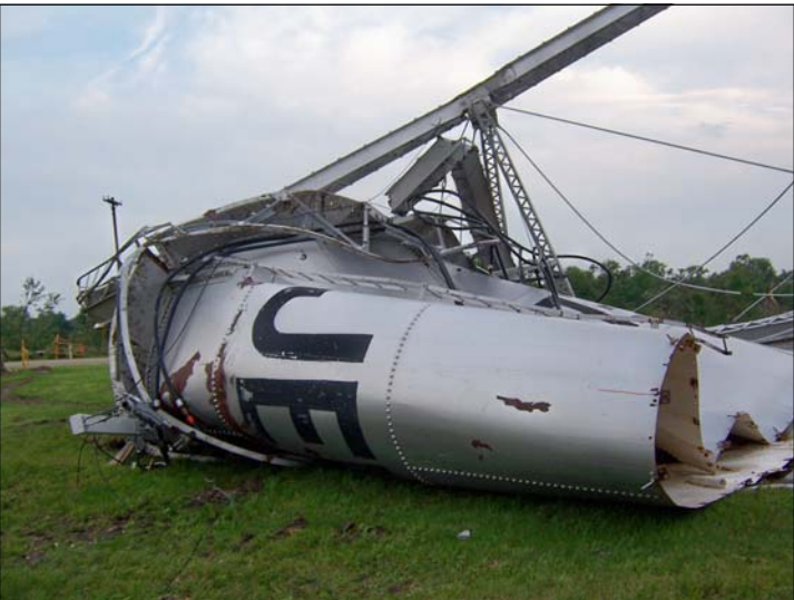
This photo shows the crumpled remains of the City of Jewell's water tower following the May 29 tornado.

Commerce in the Urgent Need category to help replace its water tower and essential pumping equipment that was destroyed. Insurance proceeds are well below replacement estimates. The city has procured an engineer and is working with the NCRPC and the Kansas Department of Commerce.