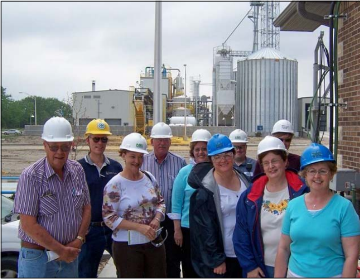
Board Takes Field Trip. The NCRPC Executive Board took a field trip to an ethanol plant for its May 22 meeting. Members of the board and staff toured Nesika Energy, LLC, rural Scandia.