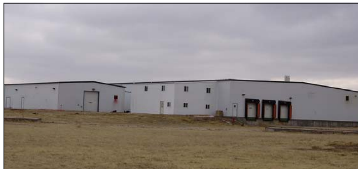
CT Fabrication, LLC, is located just east of Scandia along US Highway 36. It made use of a former vegetable processing plant.

A recent project added an office addition to the building. Prior to the office construction, managers were using an office in nearby Belleville.