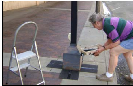
A volunteer paints the base of one of the light poles in the Salina downtown.