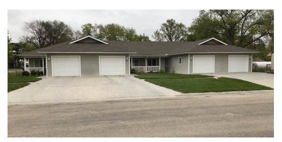
The NCRPC manages affordable housing units for local developments in Beloit and Jewell with a combined total of 13 units. Pictured here is Heritage Townhomes of Jewell.