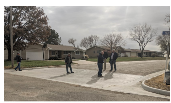
NCRPC administered a CDBG Community Facilities stormwater drainage improvement project throughout the City of Linn. CDBG funds were matched with a USDA Rural Development Loan and city funds.