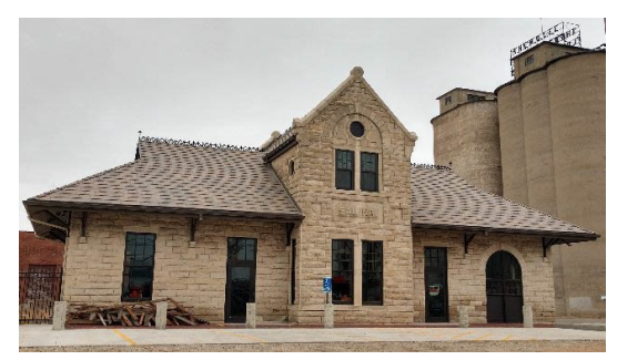
NCRPC administered a CDBG Commercial Rehabilitation project that helped restore a former depot on North Santa Fe Avenue in Salina.