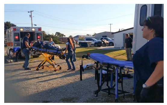
A full-scale exercise in Osborne County this year provided an opportunity to test emergency response capabilities. The NCRPC is fiscal agent for six Regional Homeland Security Councils.

Learn more about NCRPC services at: ncrpc.org/services