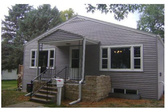
Housing rehabilitation was completed on 11 homes in 2019.