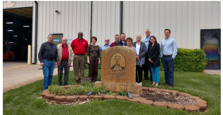
NCRPC Executive Board members take a field trip to a location in the region each year. In 2019, the board met in Ottawa County and toured the G.L. Huyett facilities.