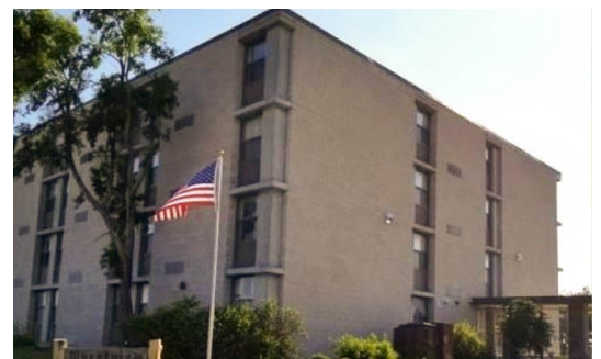
An example of a recent multi-family weatherization project that NCRPC administered in Ness City.