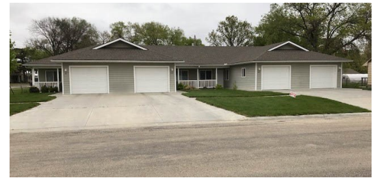
The NCRPC manages affordable housing units for local developments in Beloit and Jewell with a combined total of 13 units. Pictured here is Heritage Townhomes of Jewell.