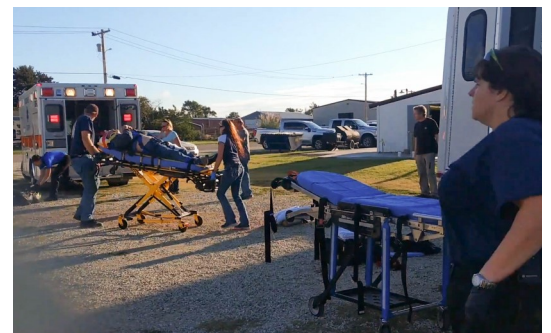
A full-scale exercise in Osborne County this year provided an opportunity to test emergency response capabilities. The NCRPC is fiscal agent for six Regional Homeland Security Councils.

Project investments address the planning, organization, equipment, training and exercise needs that help build local and regional response capabilities and encourage citizen safety and preparedness.