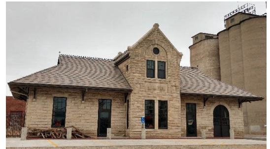
NCRPC administered a CDBG Commercial Rehabilitation project that helped restore a former depot on North Santa Fe Avenue in Salina.