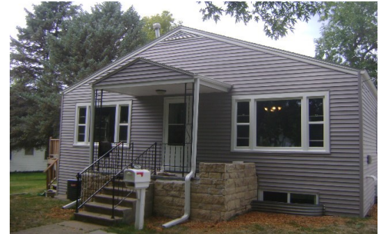
Housing rehabilitation was completed on 11 homes in 2019.