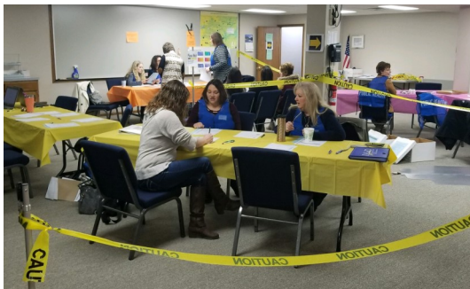
Representatives of 13 county health departments that make up the North Central Kansas Public Health Initiative (NCKPHI) Region participated in a Point of Dispensing Clinic exercise in January.