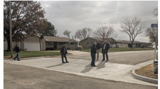
NCRPC administered a CDBG Community Facilities stormwater drainage improvement project throughout the City of Linn. CDBG funds were matched with a USDA Rural Development Loan and city funds.