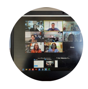
Photo: North Central Kansas Public Health Initiative participants continued to meet and work together using Zoom.

NCRPC continued to work with 13 local health departments through the North Central Kansas Public Health Initiative (NCKPHI) to improve and protect the health of their communities. The NCRPC provides administrative, fiscal and support services through the regional public health emergency preparedness and response grant. COVID tested the plans and mitigation strategies that the NCKPHI prepares for through planning, training and exercise in the event that a pandemic or any disaster occurs.