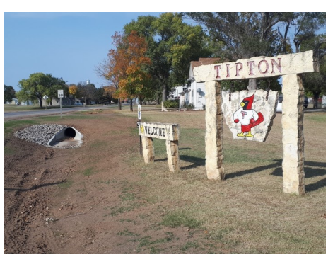
A recent project in the City of Tipton improved the city's storm drainage system.

"We have been very pleased with the results of the recent drainage project in Tipton," Krier said. "Since moving in to this home, I have stressed about the water collecting in the ditch with younger children. Thankfully, this