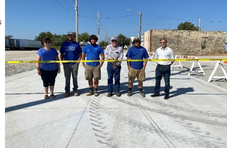
The City of Frankfort completed a project in Fall 2020 that improved one of its existing truck routes. The project was funded through a combination of a CDBG grant and a USDA Rural Development Ioan.

The resulting project upgraded the existing highly trafficked west truck route to concrete pavement. Corresponding storm sewer, sidewalks and curb and gutter improvements