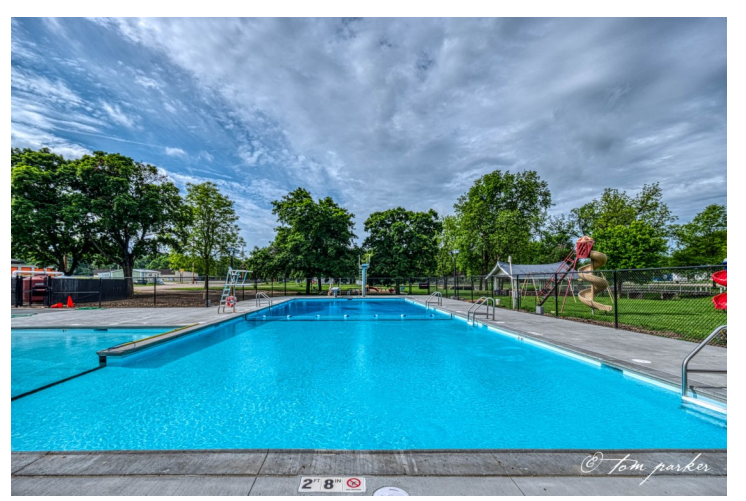
The City of Blue Rapids swimming pool project was completed earlier this year.

The project was made possible, in part, through a special round of Community Development Block Grant (CDBG) funding awarded in 2019. The grant award was $763,411. The