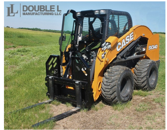
Double L Manufacturing worked with Technology Development Institute to create SolidWorks™ models for some of its product lines.