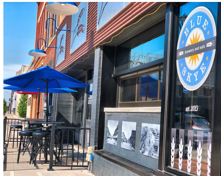
Blue Skye Brewery and Eats, LLC, is located at 116 N. Santa Fe Avenue, Salina, Kansas.

In Fall 2020, the business expanded its wholesale line by the keg and began offering it to other local restaurant/bars to meet the trend of having a local craft beer on tap. They