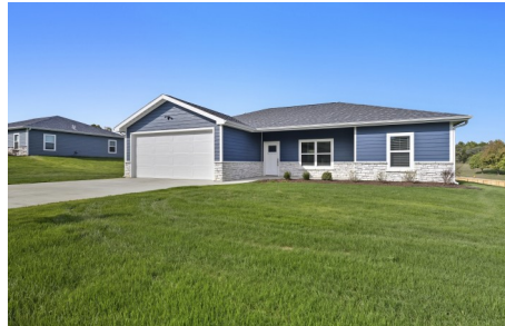
The Rural Development Group has built new homes in several communities in the region, similar to the one shown here.

The new 1,886-square-foot homes have three bedrooms, two baths, a two-car garage, a reinforced storm